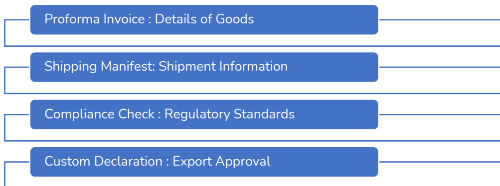
Figure 3. Example Document for Export

Documentation processes play a crucial role in ensuring compliance with international standards and facilitating smooth export operations. CV Pasific Harvest utilizes comprehensive export documentation, including proforma invoices and shipping manifests, which enhance its credibility and reliability as an exporter. However, the documentation process is labor-intensive and susceptible to errors, especially during high-volume export periods. Adopting digital tools such as export management software could streamline these processes, reduce errors, and improve overall efficiency by integrating inventory and export documentation systems.