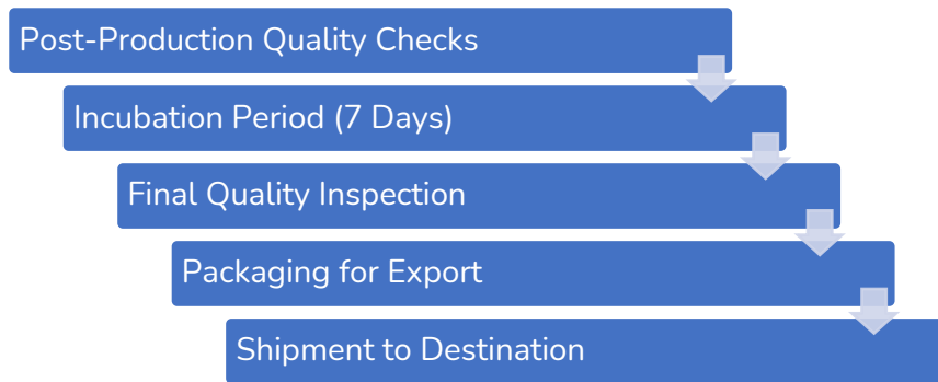
Figure 2. Diagram of Goods Handling and Quality Control Process

dispatched. However, challenges persist, particularly with product damage caused by improper stacking during storage. To mitigate this, the company could implement advanced storage solutions such as automated stacking systems or improve warehouse staff training on proper handling techniques.