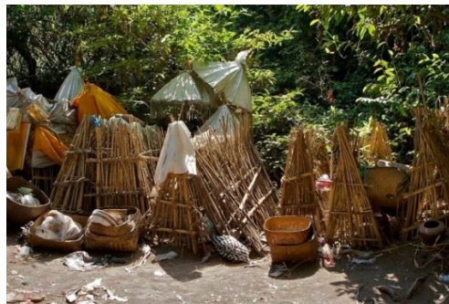
Figure 1.4 Sema Wayah Trunyan Bali

Researchers found that the government pays little attention to the promotion of dark tourism on several tours that contain dark history in Indonesia, so information about dark tourism is still relatively minimal. The consumption of dark tourism is shackled by segmented tourists and their loyalty is quite high to experiencing dark tourism. In fact, dark tourism can educate the public to learn the background and remember the process of historical events in that place.