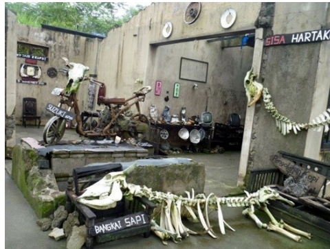
Figure 1.3 Sisa Hartaku Museum

Sema Wayah Trunyan, Bali has a unique funeral tradition. People who died there were not buried or cremated, but only placed under the Taru Menyan tree. This tree will be able to eliminate the smell of the corpses there. The number of bodies placed under Taru Menyan cannot exceed eleven people. Apart from that, there are several conditions that must be met, including dying naturally, being married, having complete body parts. Those who die according to the above conditions will be buried in Mepasah (placed under the Taru Menyan). The burial area is called Sema Wayah.